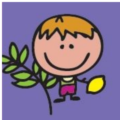
K'tanim: Sukkot Sun, Oct 4 at 9:00 AM