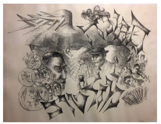
Rabbi and Musicians by Chaim Gross

Located on the lower level opposite the Tucker Lounge, framed by the original inserts from the TBE Ark Doors, are the following group of paintings and photographs: