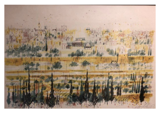
View of a Village Israeli School