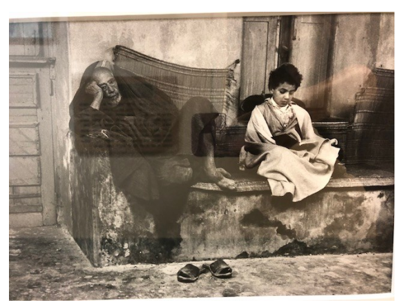
Old Man Sleeping-Young Boy Seated Israeli School