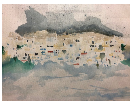
View Israeli Town by Shmuel Katz Blume