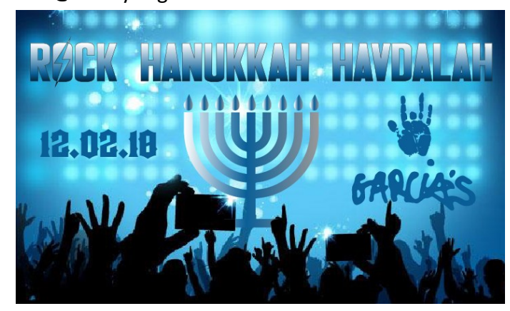
Featuring Brad! Doors open at 3:30 PM. Concert at 4:00 PM. Garcia's at Capitol Theater. Tickets online.