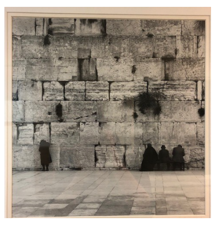
Praying at the Western Wall by Beth Shephard