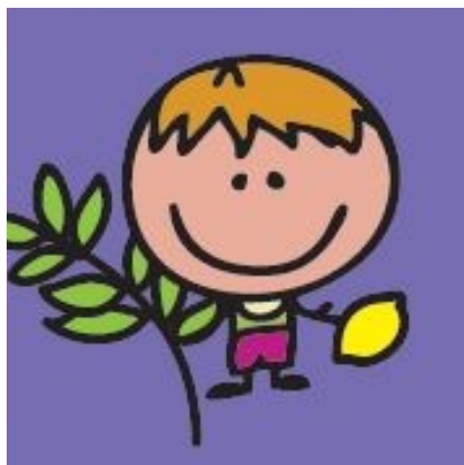
K’tanim: Sukkot Sun, Sept 23, at 9:30 AM

K’tanim means “little ones.” Join us throughout the year for these programs designed for Preschoolers. A great introduction to Judaism for our youngest members! Open to the Community.