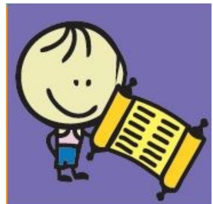
K’tanim: Noah’s Ark Sun, Oct 14, at 9:30 AM